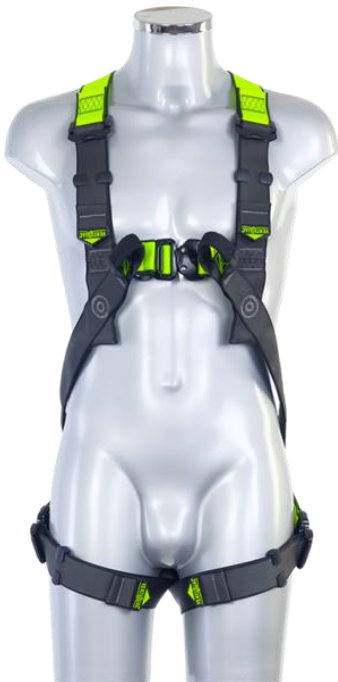
V3 ENTERPRISE Automatic