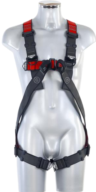
V3 ENTERPRISE Classic

V3 ENTERPRISE SCAFF: full body harness + dorsal extension strap (non-removable);